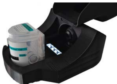
Drug Reader Plus